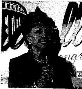
CAMPAIGN: Del. Madeleine Bordallo announces her bid for a ninth term at the Plaza de España in Hagåtña in February.

The congresswoman’s bill also seeks to codify the Department of Defense’s “net-negative” commitment to hold fewer lands on Guam at the conclusion