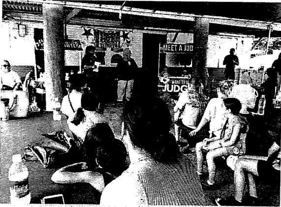
JUSTICE PATCH: Members of the Girl Scouts of Guam attend the unveiling of the Girl Scouts Justice patches Saturday at the Agana Heights Mayor's Office.