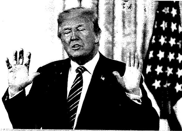
DEMANDING AN INVESTIGATION: President Donald Trump gestures as he delivers remarks during the Prison Reform Summit at the White House in Washington, D.C., May 18.

This week marked the one-year anniversary of Robert Mueller's appointment as special counsel to lead a probe into election meddling by Russia. Trump and some Republicans are increasingly pressing the argument that the inquiry should be shut down because it was irreversibly tainted by improper actions well before Mueller was appointed.